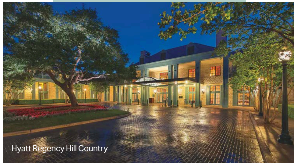
Hyatt Regency Hill Country

TSGE has a special room rate of $239 plus $5 daily hotel fee for singles and doubles. Room rates do not include tax. Please call by August 24, 2023 to make your reservations. Be sure to mention that you are part of the TSGE meeting.